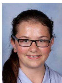
Danica Loulie-Wijtenburg Cultural Trophy For Girls Middle School