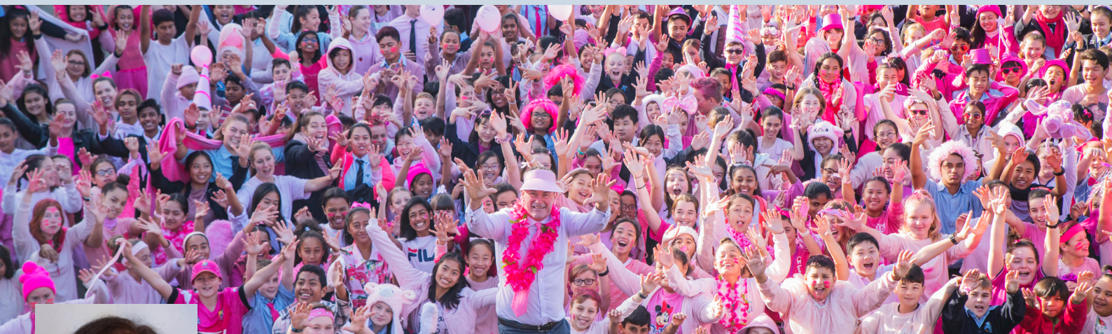
Pink Shirt Day, Anti-Bullying Week 2019